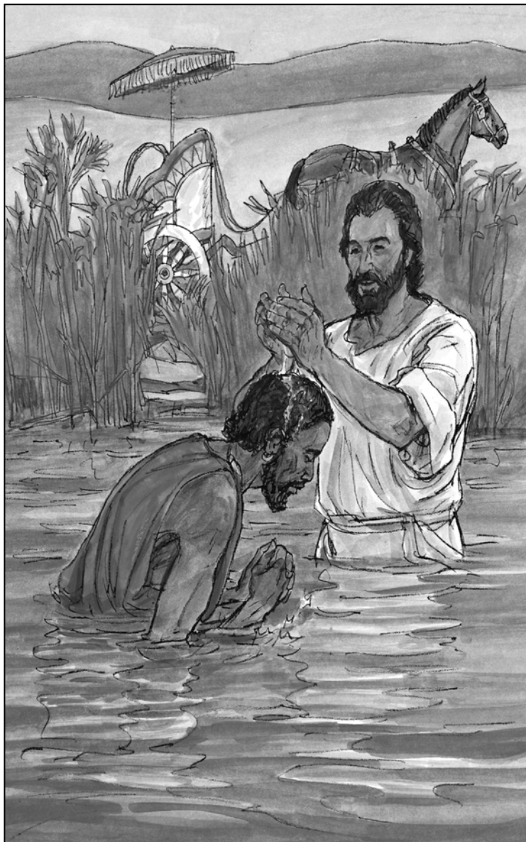
Philip baptized the man from Ethiopia.